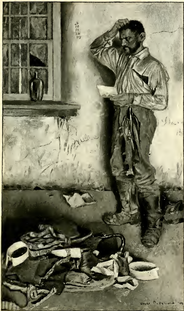
PERHAPS THE HOUSE HAD BEEN ROBBED